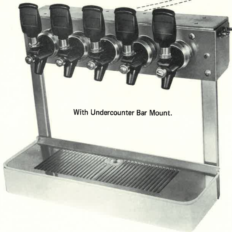
With Undercounter Bar Mount.